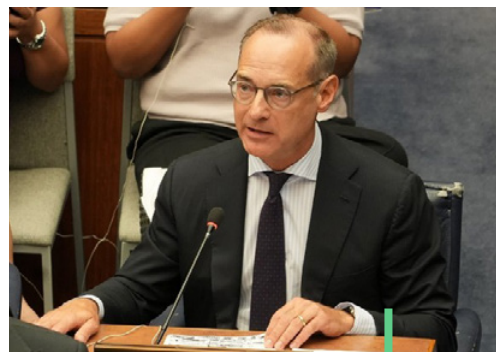
UN's Climate Ambition Summit 2023

The work detailed in the following pages strengthens my confidence in the ability of determined individuals to collaborate and find solutions to even the world's most challenging problems. Please enjoy reading this short version of Allianz's Sustainability Reporting. We are in this together. Today more than ever before.