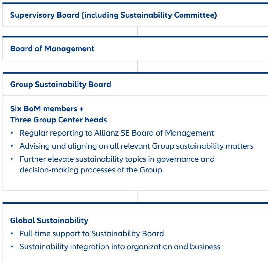
Graphic 2: Governance

The Group Sustainability Board, supported by the Chief Sustainability Officer, implements the strategy and engages colleagues across the business. Further, local responsibilities for sustainability integration are allocated at Board level and supported by at least one Sustainability Lead. We appropriately integrate sustainability into our remuneration systems, encouraging board members to consider environmental, social, and governance factors in decision making process. Our approach combines accountability and governance to drive a consistent strategic approach. For more detailed information see Non Financial Statement and Sustainability Report.