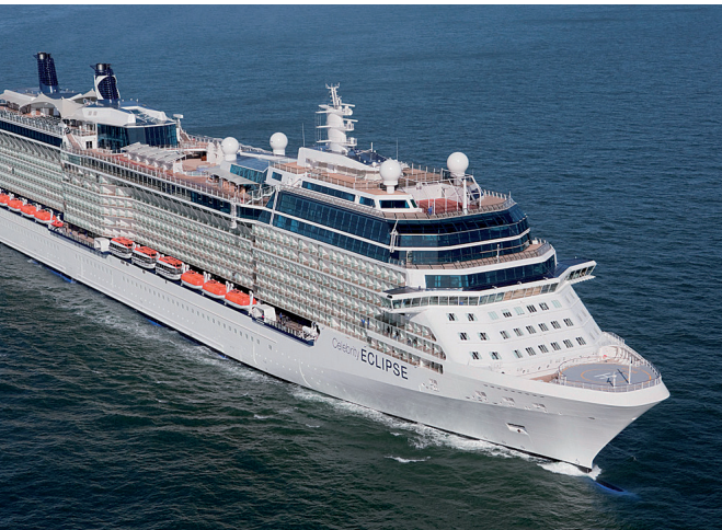
The cruise liner Celebrity ECLIPSE, built by the Meyer Werft shipyard in Papenburg and secured by guarantees from Euler Hermes.

Then Euler Hermes is exactly the right provider for you. With our online guarantee service, you can immediately view all your active guarantees and set up new ones – and will generally receive a positive response straight away. The service is easy to use, and you only have to enter a small amount of information. If your requirements are more complex, our experts will also be happy to advise you personally.