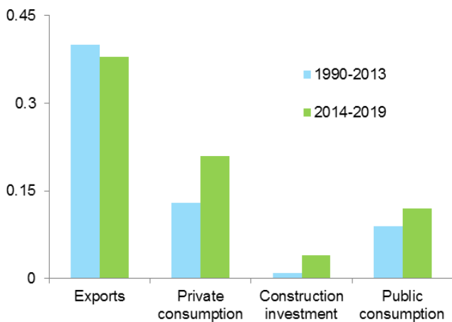
Figure 2 – Germany: Average contributions to quarterly GDP growth (ppt)